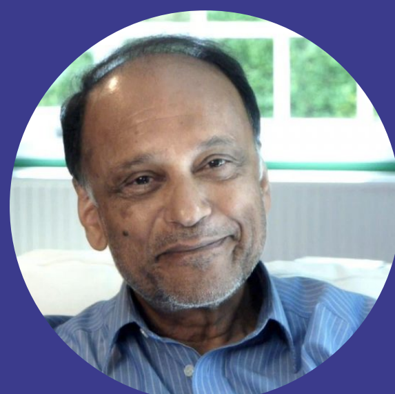
Professor Sir Partha Dasgupta University of Cambridge