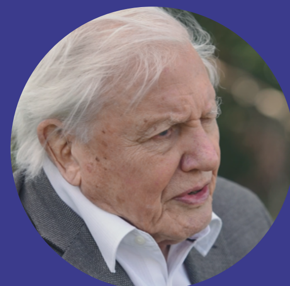
Sir David Attenborough COP26 People's Champion (video message)